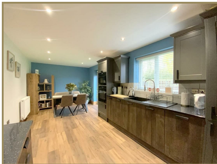
5 Bevers Way, Holton-Le-Clay, Lincolnshire, DN36 5FH £280,000